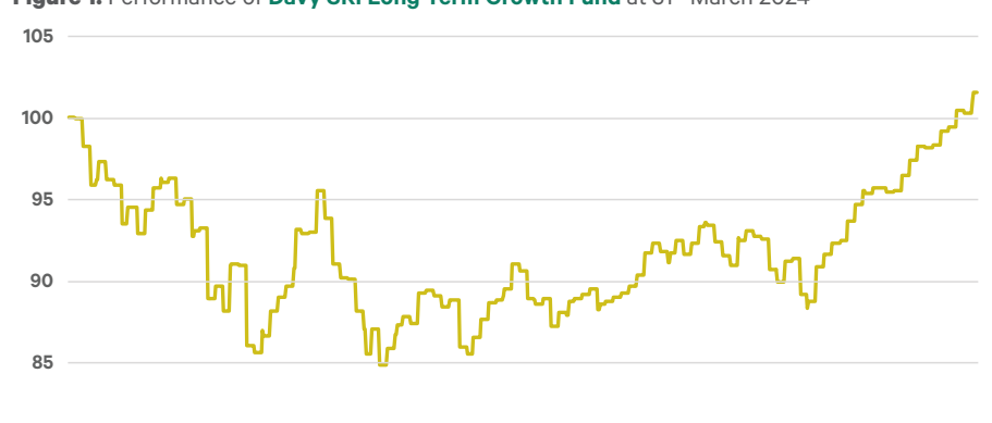
Figure 1: Performance of Davy SRI Long Term Growth Fund at 31st March 2024

Warning: Past Performance is not a reliable guide to future performance. The value of your investment may go down as well as up. This product may be affected by changes in currency exchange rates.