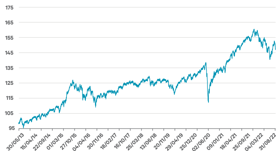
Figure 1: Performance of Davy Moderate Growth Fund at 31 st August 2022

Warning: Past Performance is not a reliable guide to future performance. The value of your investment may go down as well as up. This product may be affected by changes in currency exchange rates