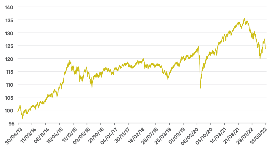
Table 1: Performance (Net of Fees) 5,6