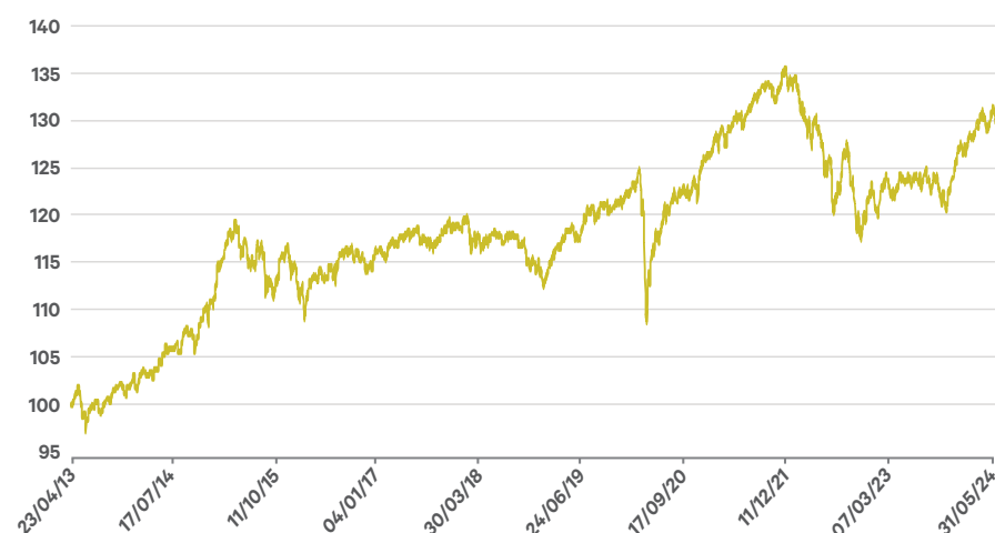
Figure 1: Performance of Davy Cautious Growth Fund at 31 st May 2024 6

Warning: Past Performance is not a reliable guide to future performance. The value of your investment may go down as well as up. This product may be affected by changes in currency exchange rates.