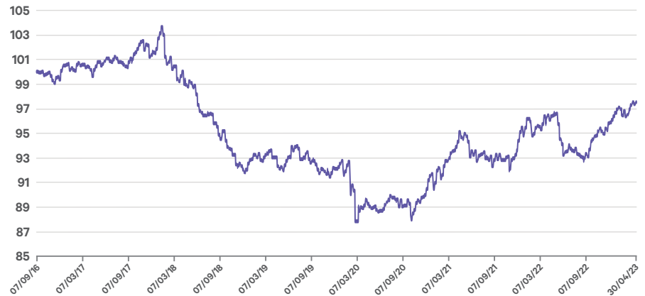
Figure 1: Performance of Target Return Foundation Fund at 30 th April 2023