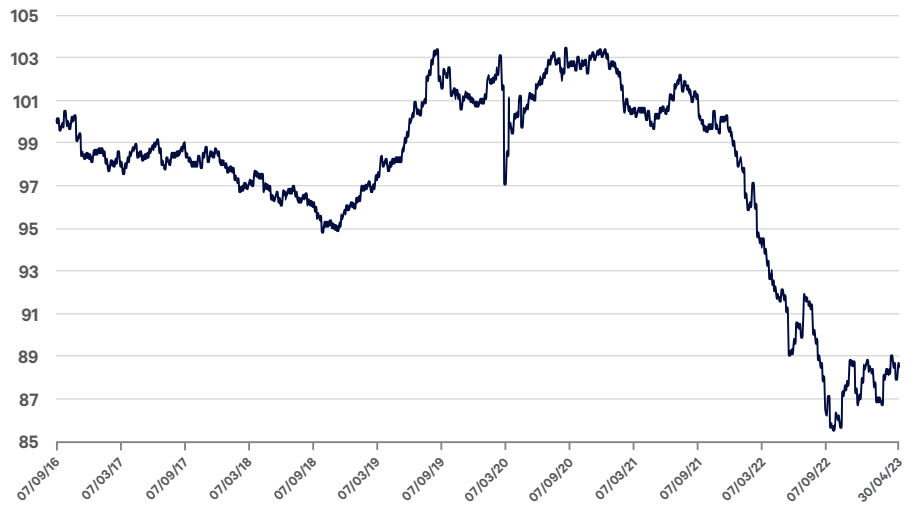
Figure 1: Performance of Global Fixed Income Foundation Fund at 30 th April 2023

Warning: Past Performance is not a reliable guide to future performance. The value of your investment may go down as well as up. This product may be affected by changes in currency exchange rates