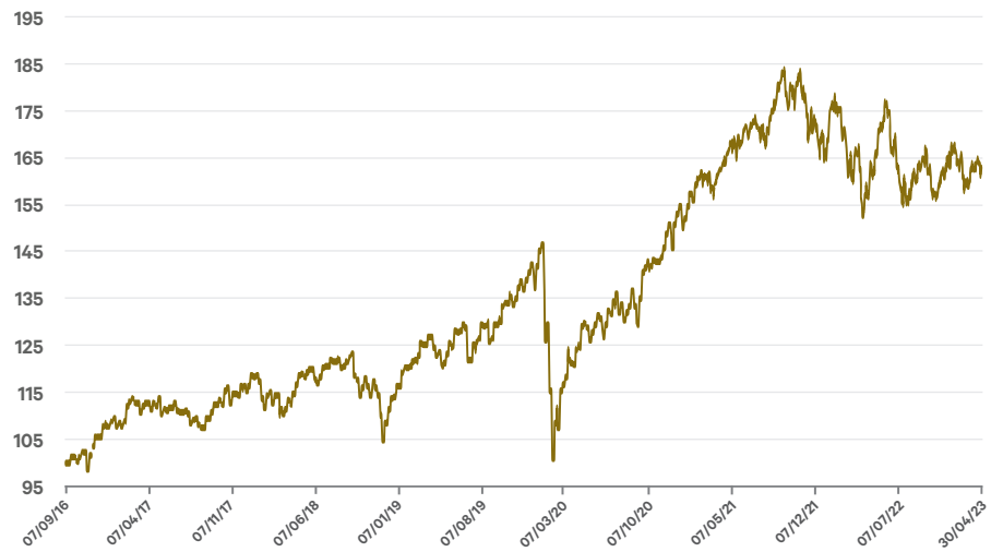
Figure 1: Performance of the Global Equities Foundation Fund at 30 th April 2023

Warning: Past Performance is not a reliable guide to future performance. The value of your investment may go down as well as up. This product may be affected by changes in currency exchange rates