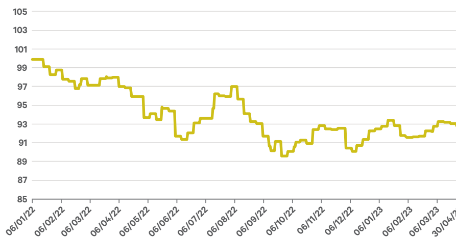
Figure 1: Performance of Davy SRI Cautious Growth Fund at 30 th April 2023