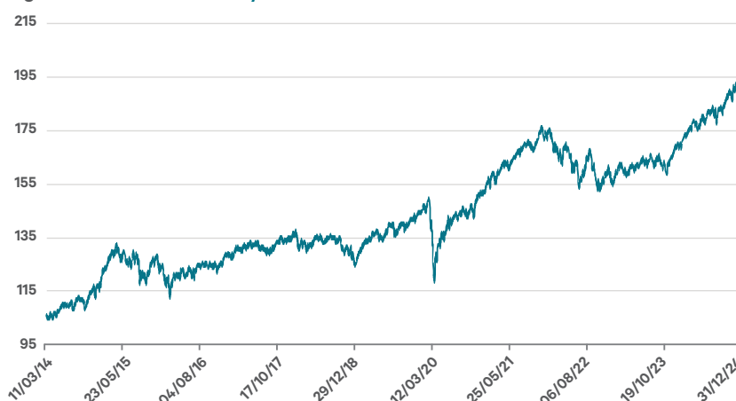
Figure 1: Performance of Davy Moderate Growth Fund at 31 st December 2024.