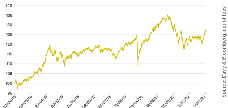
Figure 1: Performance of Davy Cautious Growth Fund at 31 st December 2023.