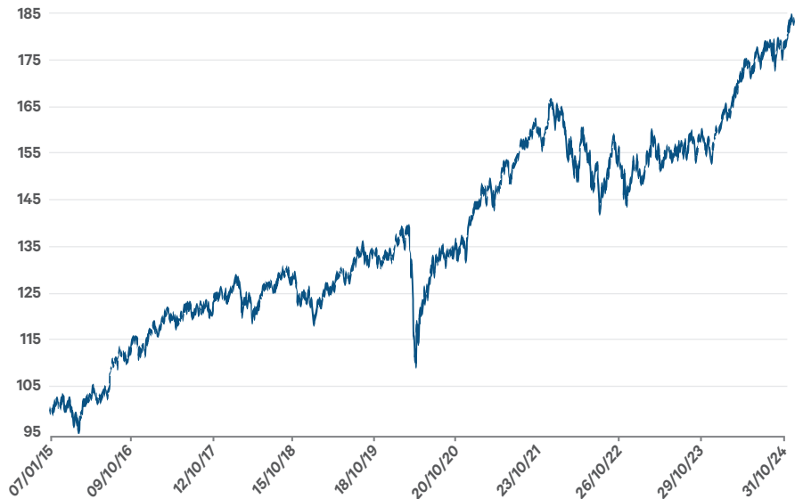
Figure 1: Performance of Davy UK GPS Long Term Growth Fund at 31 st October 2024

Warning: Past Performance is not a reliable guide to future performance. The value of your investment may go down as well as up. This product may be affected by changes in currency exchange rates.