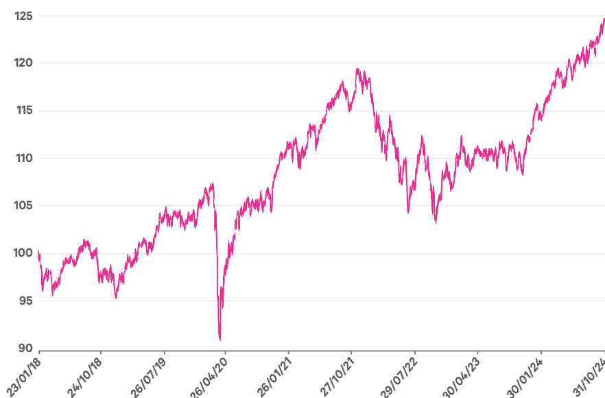
Figure 1: Performance of the Davy UK GPS Defensive Growth Fund at 31 st October 2024

Warning: Past Performance is not a reliable guide to future performance. The value of your investment may go down as well as up. This product may be affected by changes in currency exchange rates.