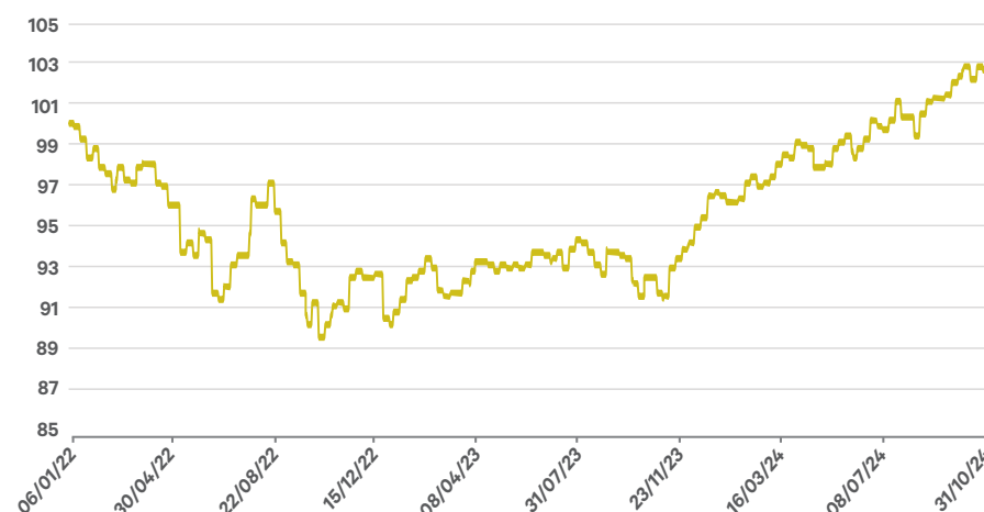
Figure 1: Performance of Davy SRI Cautious Growth Fund at 31 st October 2024