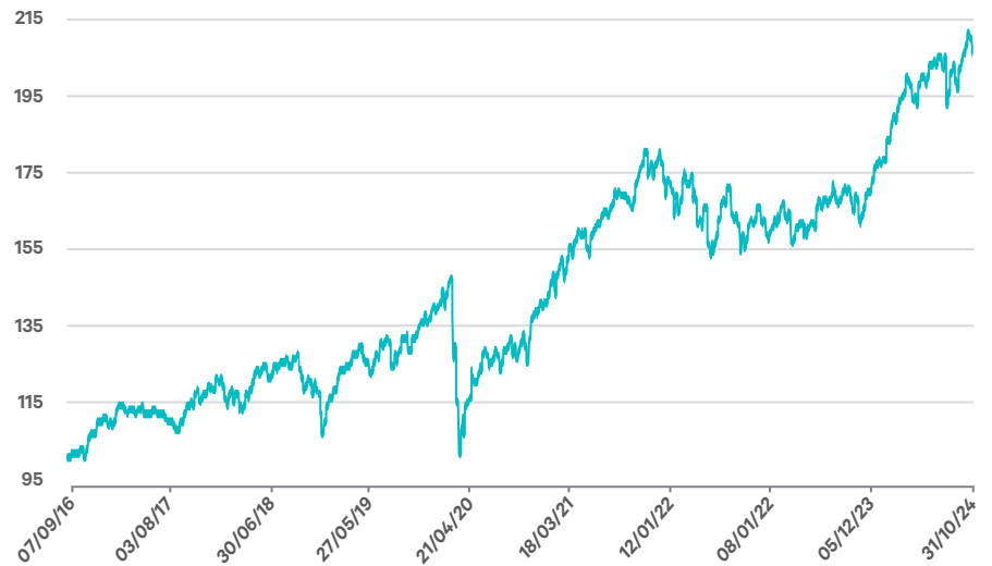
Figure 1: Performance of the Factor Equity Foundation Fund at 31 st October 2024

Warning: Past Performance is not a reliable guide to future performance. The value of your investment may go down as well as up. This product may be affected by changes in currency exchange rates.