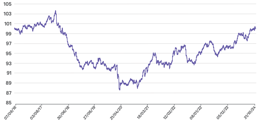
Figure 1: Performance of Target Return Foundation Fund at 31 st October 2024