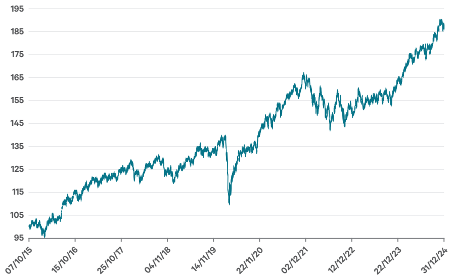
Figure 1: Performance of Davy UK GPS Long Term Growth Fund at 31 st December 2024

Warning: Past Performance is not a reliable guide to future performance. The value of your investment may go down as well as up. This product may be affected by changes in currency exchange rates.