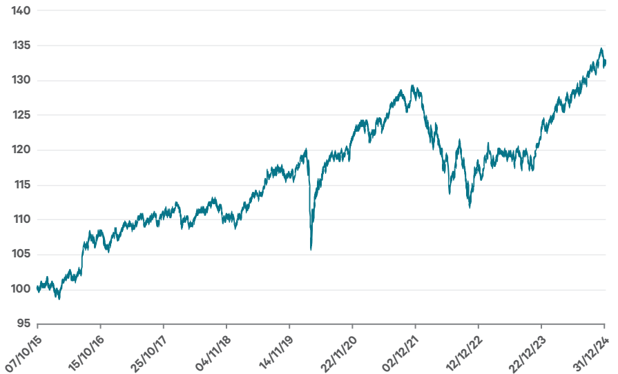
Figure 1: Performance of Davy UK GPS Cautious Growth Fund at 31 st December 2024

Warning: Past Performance is not a reliable guide to future performance. The value of your investment may go down as well as up. This product may be affected by changes in currency exchange rates.