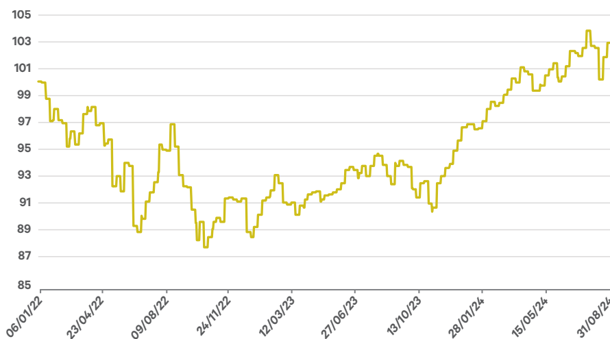
Figure 1: Performance of Davy SRI Moderate Growth Fund at 31 st August 2024