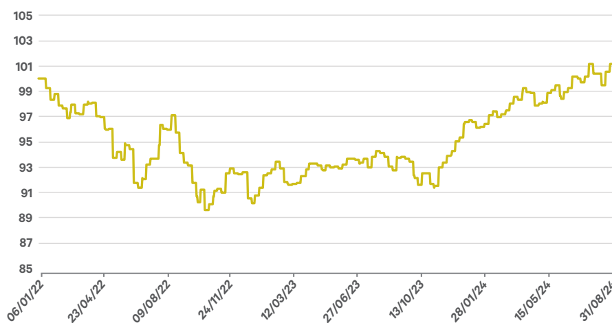
Figure 1: Performance of Davy SRI Cautious Growth Fund at 31 st August 2024