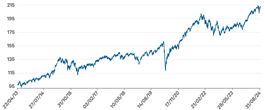
Figure 1: Performance of Davy Long Term Growth Fund at 31 st August 2024 6

Warning: Past Performance is not a reliable guide to future performance. The value of your investment may go down as well as up. This product may be affected by changes in currency exchange rates.