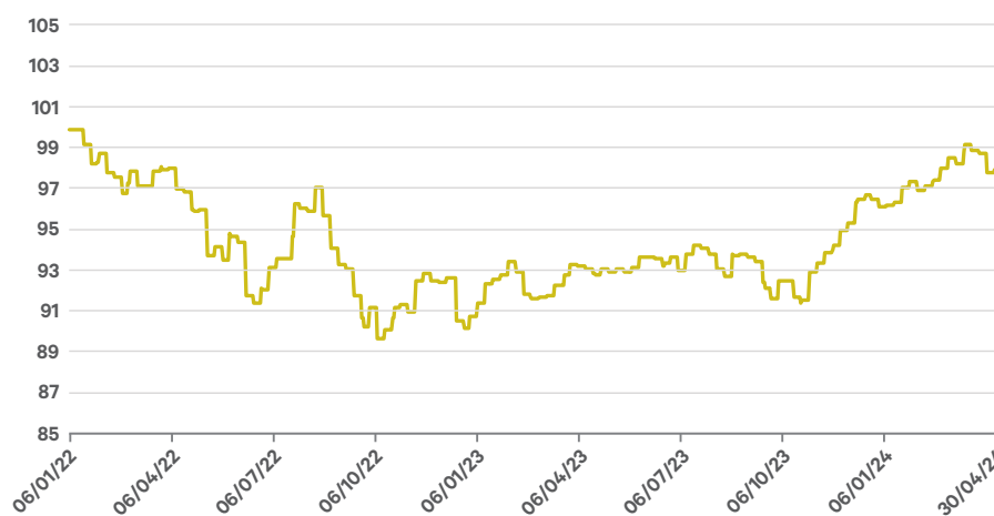
Figure 1: Performance of Davy SRI Cautious Growth Fund at 30 th April 2024