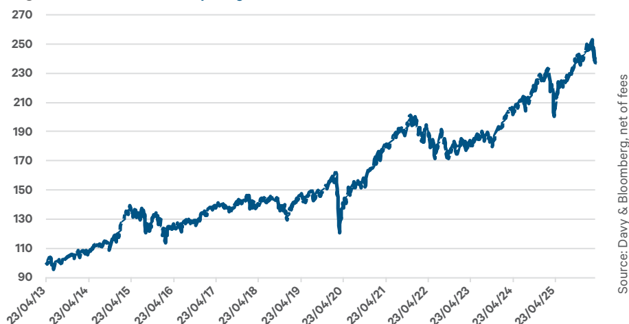
Figure 1: Performance of Davy Long Term Growth Fund at 31 st March 2026.