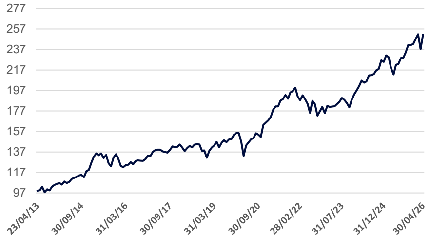
Figure 1: Performance of Long Term Growth Fund at 30 th April 2026 6