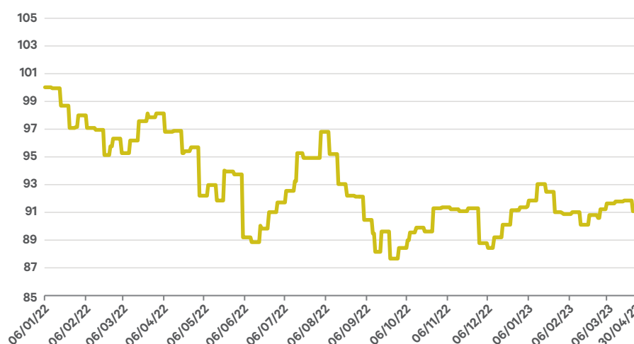
Figure 1: Performance of Davy SRI Moderate Growth Fund at 30 th April 2023