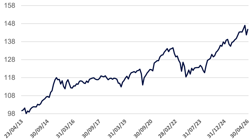
Figure 1: Performance of Cautious Growth Fund at 30 th April 2026 6