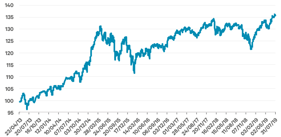
Figure 1: Performance of Davy Balanced Growth Fund at 31st July 2019 6

WARNING: Past performance is not a reliable guide to future performance. The value of your investment may go down as well as up. This product may be affected by changes in currency exchange rates.