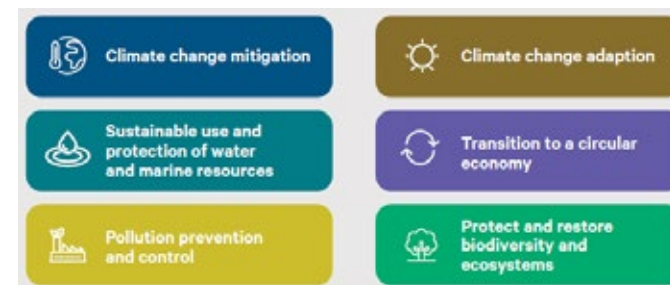
Fig. 3: EU Taxonomy environmental objectives