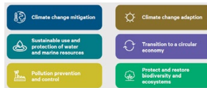
Fig. 3: EU Taxonomy environmental objectives